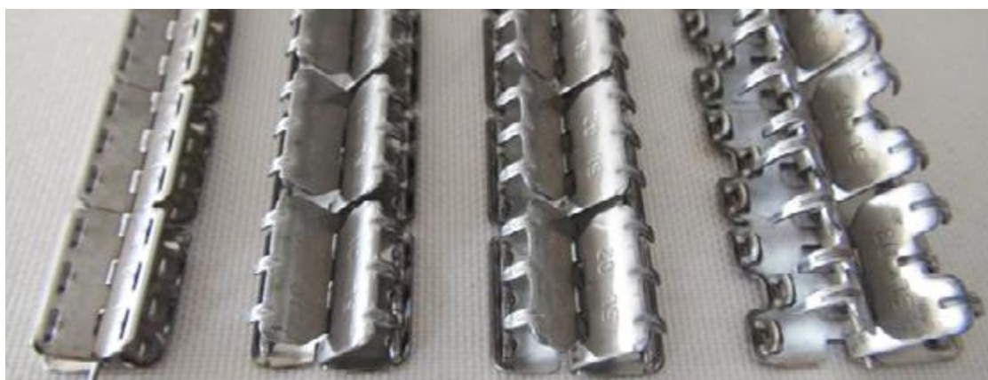
Self-Lock® 00 (stainless steel)